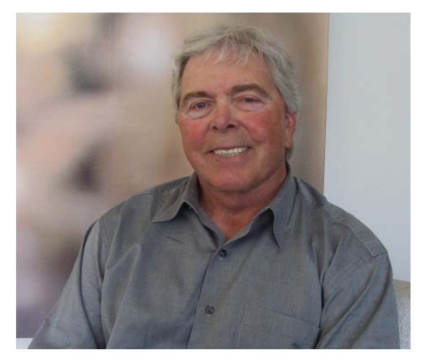
Figure 5. Herbert Boyer, co-founder of Genentech.

Genentech used a different strategy than Biogen and ultimately was successful. Since the sequence of human insulin was known, instead of isolating the human insulin gene from DNA samples, scientists at Genentech chemically synthesized the human