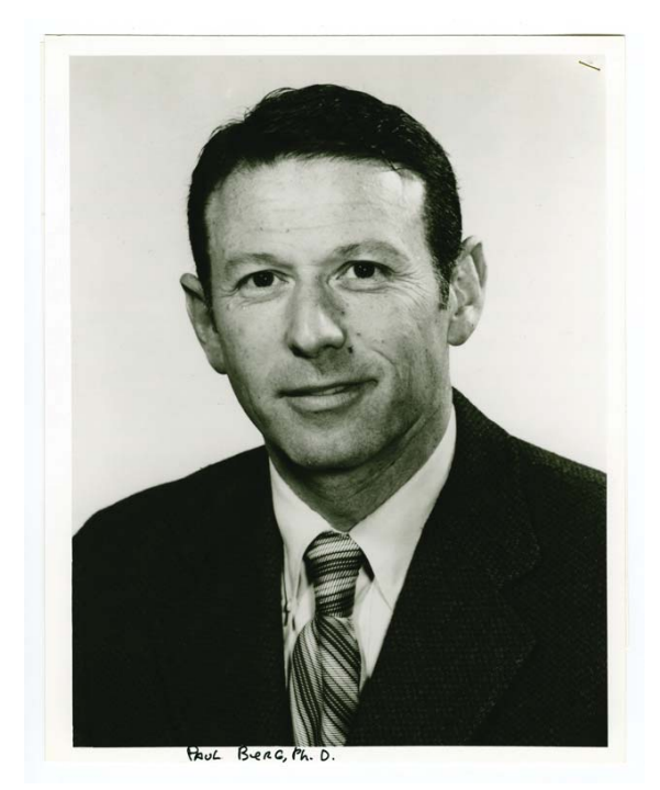
Figure 4. Photo of Paul Berg, National Library of Medicine, public doamin, http://profiles.nlm.nih.gov/CD/B/B/L/L/.

In 1975, the Asilomar Conference on Recombinant DNA, coorganized by Berg, took place in California where 140 scientists,